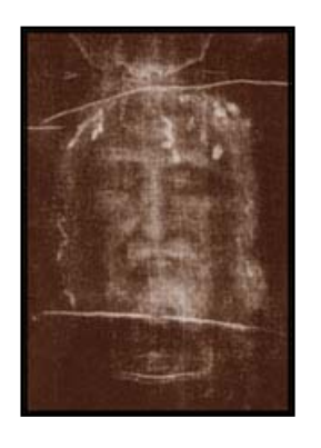
"Whoever gazes upon Me already consoles Me."

The happiness that each of us seeks can be found. It is found by helping Jesus in returning love for love. This past Christmas, I was brought to the hospital for an emergency operation. A few days later, I remember talking to a nurse about the major importance of having a devotion to the most Holy Face of Jesus. I closed my eyes for a few moments while still talking to her about Jesus and when I opened them again, I was shocked to see nurses two rows deep around my bedside, listening to me and my message! I knew this could only come from God, showing me how souls were thirsting for Him.