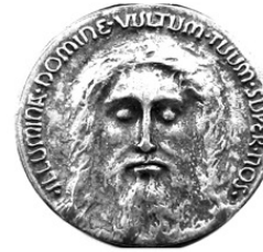
May O Lord The Light of Thy Countenance Shine Upon Us