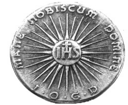
Stay with Us O Lord

On April 3, 2009 Pope Benedict XVI authorized the "beatification" of Maria Pierina de Micheli . She was officially beatified on Sunday, May 30, 2010 at St. John Lateran Cathedral.