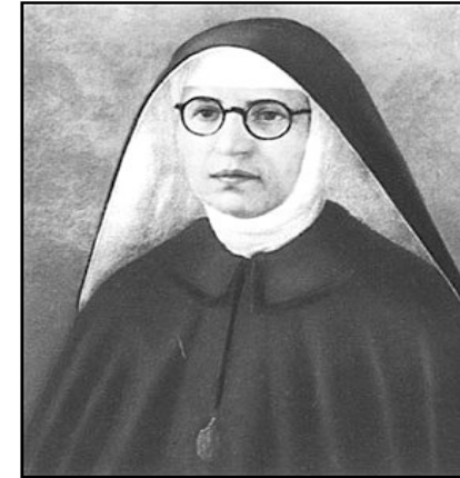
Blessed Mother Pierina "What Matters Is To Love Jesus"